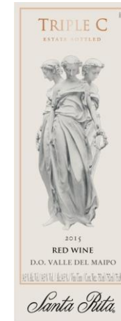
Santa Rita Triple C

Intense, deep red color with purple edges. Expressive and intense nose with cassis and black currant aromas. Elegant palate with round and persistent tannins, with fresh cherry along with a light toast flavor.